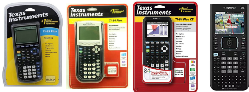
TI-83 Plus TI-84 Plus TI-84 Plus CE TI-Nspire

Graphing calculator is strongly recommended for the course. TI-84 Plus or Plus CE is highly recommended. This calculator is widely used in math, science, and engineering courses. You are required to bring a physical calculator to the exam, and sharing calculator is considered as cheating incident. Using the calculator apps on your phone is strictly prohibited on the exam. Do not purchase the TI-Nspire Graphing Calculator (around $150) because it is too advanced for this course. Instructions will not be provided for TI-Nspire.