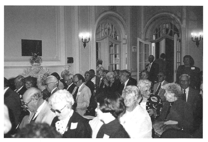
Tribute to former CHCF directors of the 25th anniversary party.

Groundbreaking for the De Anza College Learning Center expansion is scheduled for March or April, 1995. Since the new construction is coming out from the back of the Learning Center into most of the parking lot next to the Trianon, we are going to be quite heavily impacted over the next two years. We plan to be open and accessible during the construction, however our activities and programs may be more limited. If you have questions or concerns, please call the center.